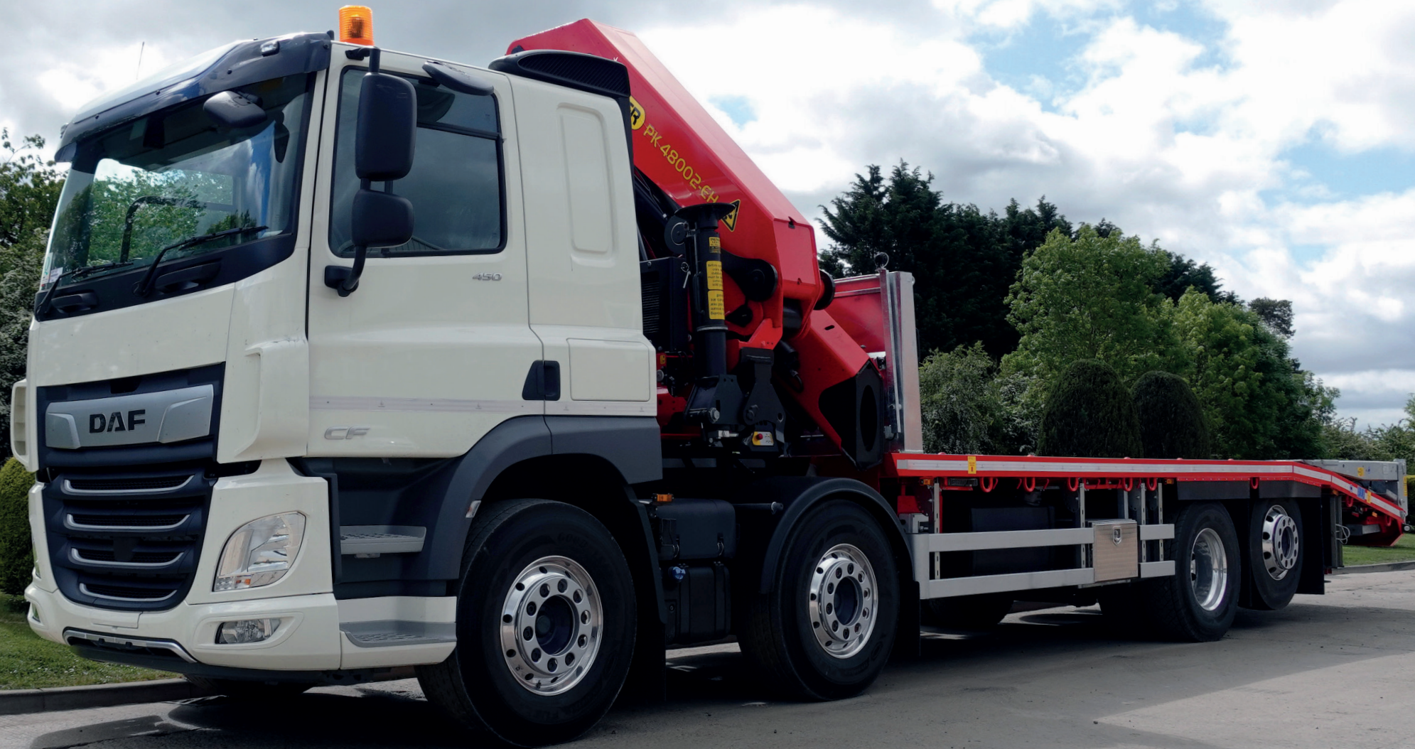
DAF CF450 FAX 8x2 Sterling Crane Lorry c/w PK48002