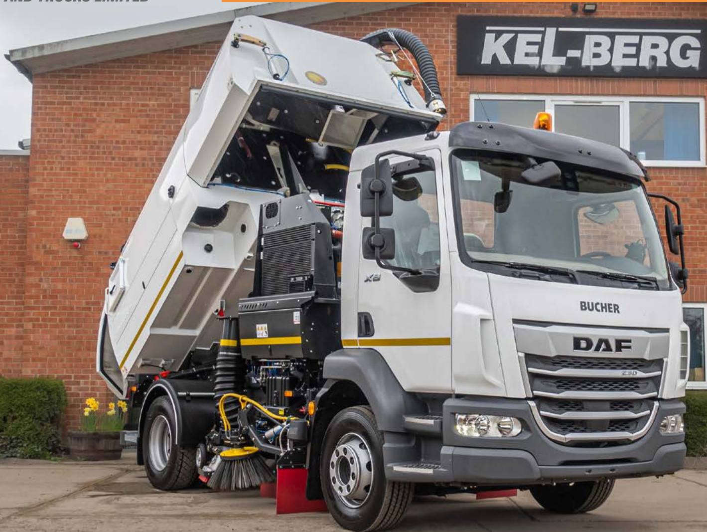
BUCHER ROAD SWEEPER