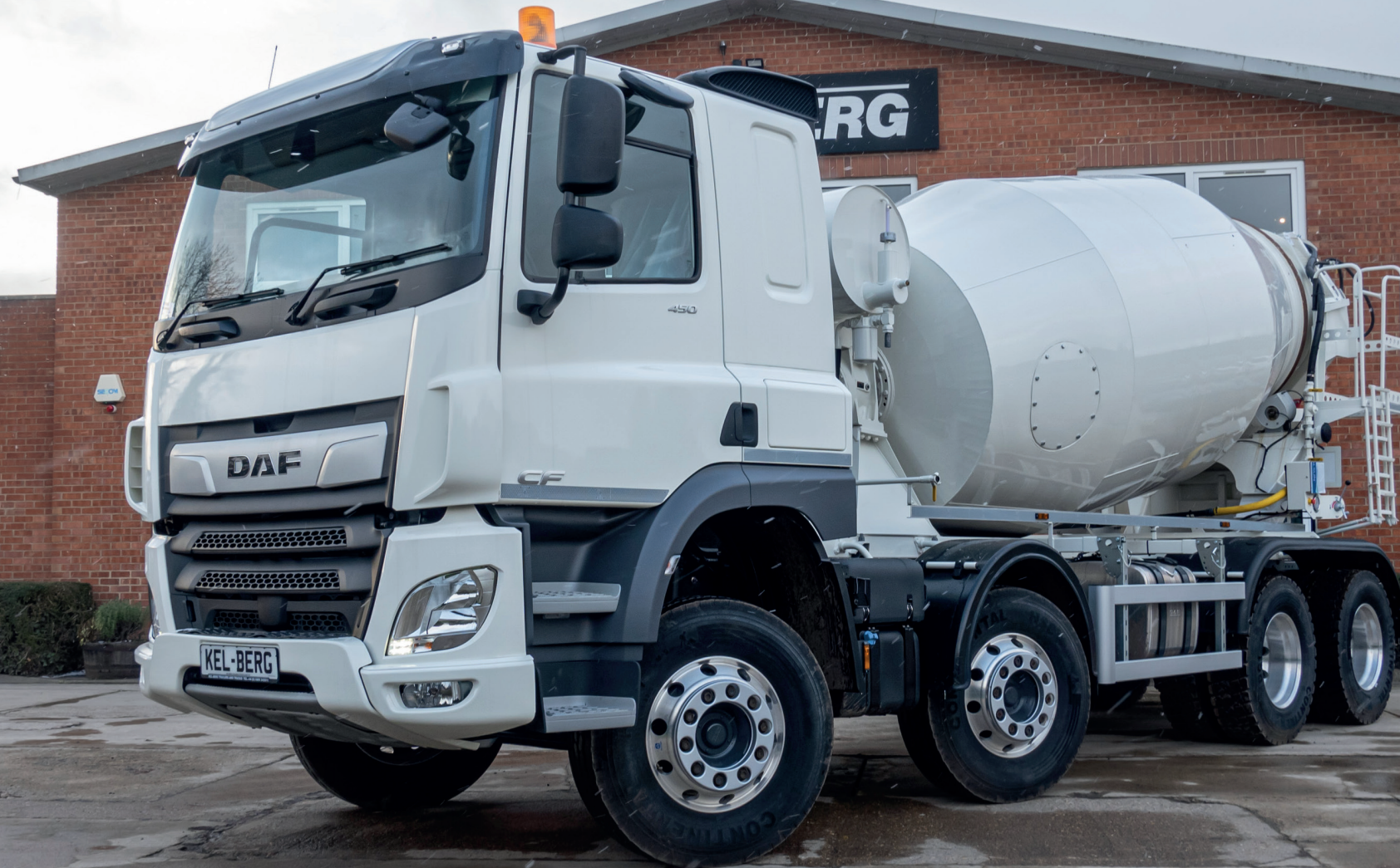
DAF CF450 8x4 Sleeper Cab c/w McPhee Mixer Installation