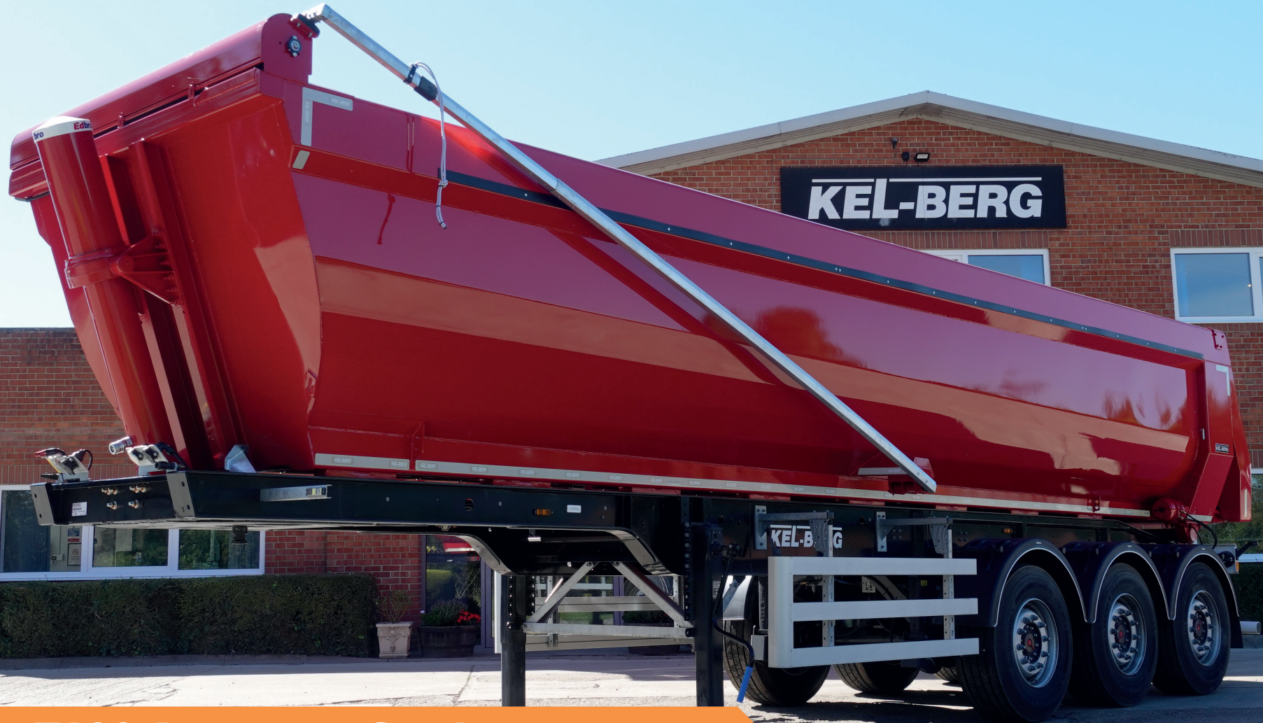
Kel-Berg T100 Aggregate Steel Tipping Trailer